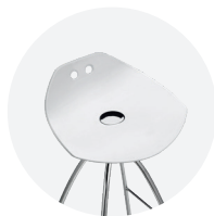
Art. 2307 Particolare del sedile con disco effetto cromato. Detail of the seat with chromed round plate.